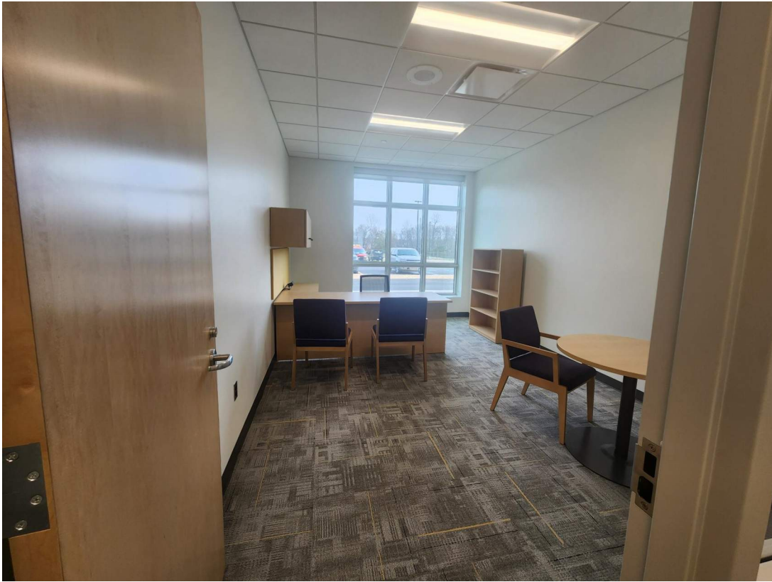
Office furniture installed.