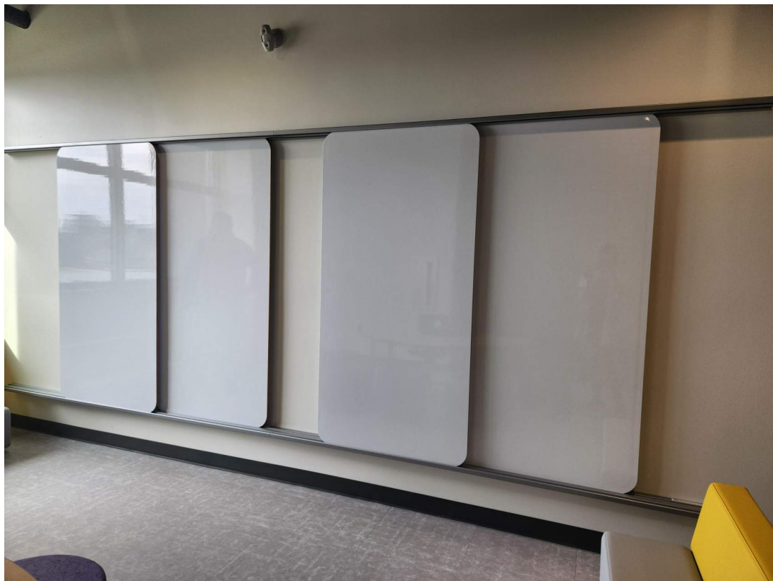
Sliding markerboards on the west side of the building.