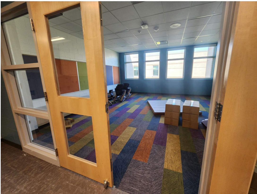
Open intervention room on the west side of the building.