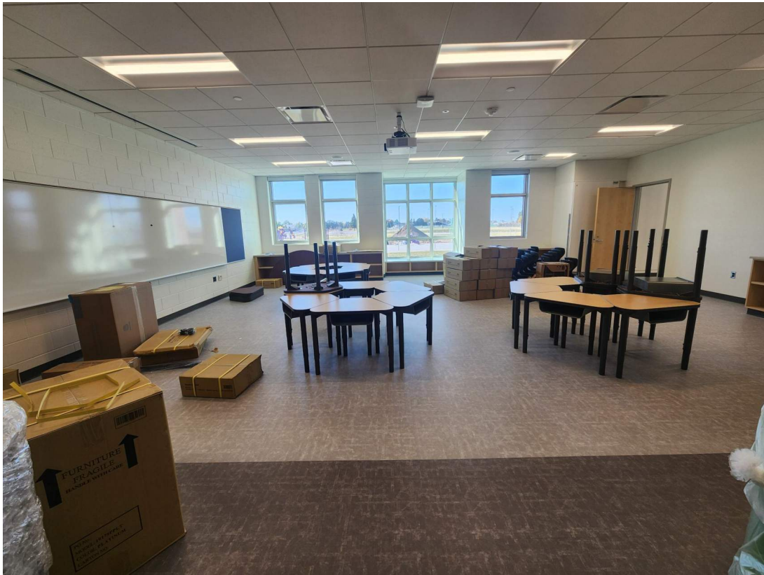
Desks being set up in classroom.