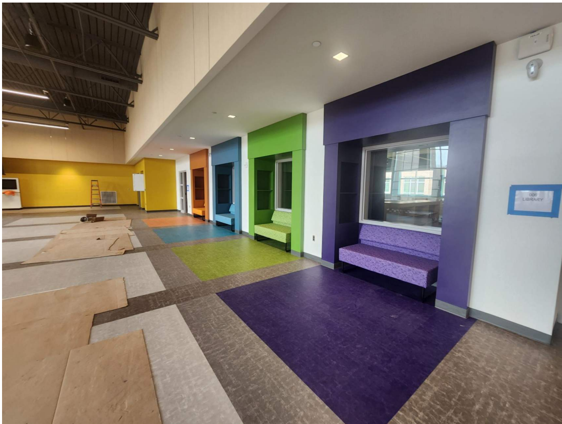
Seating installed in cafeteria.