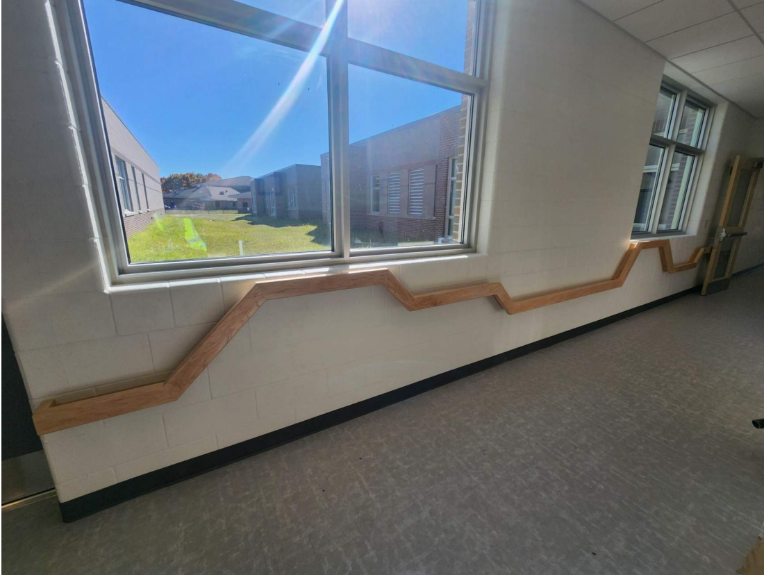
Sensory handrail installed in the central hall of the building.