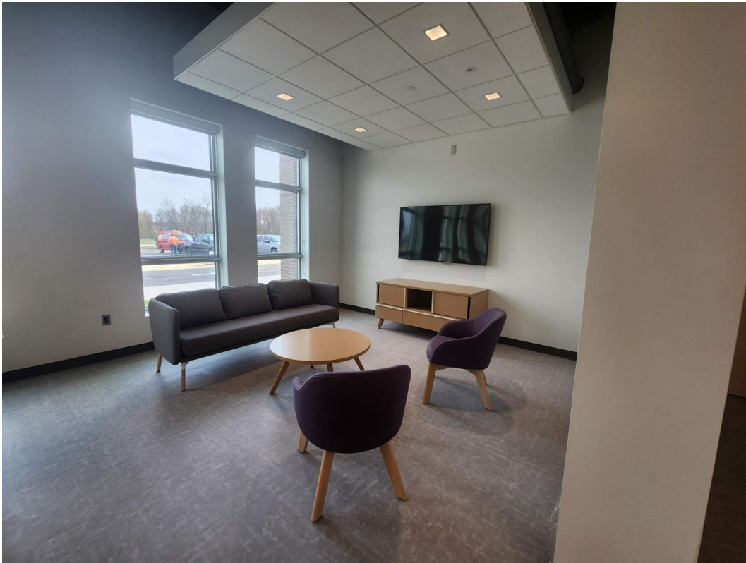
Furniture and visual display in staff lounge.