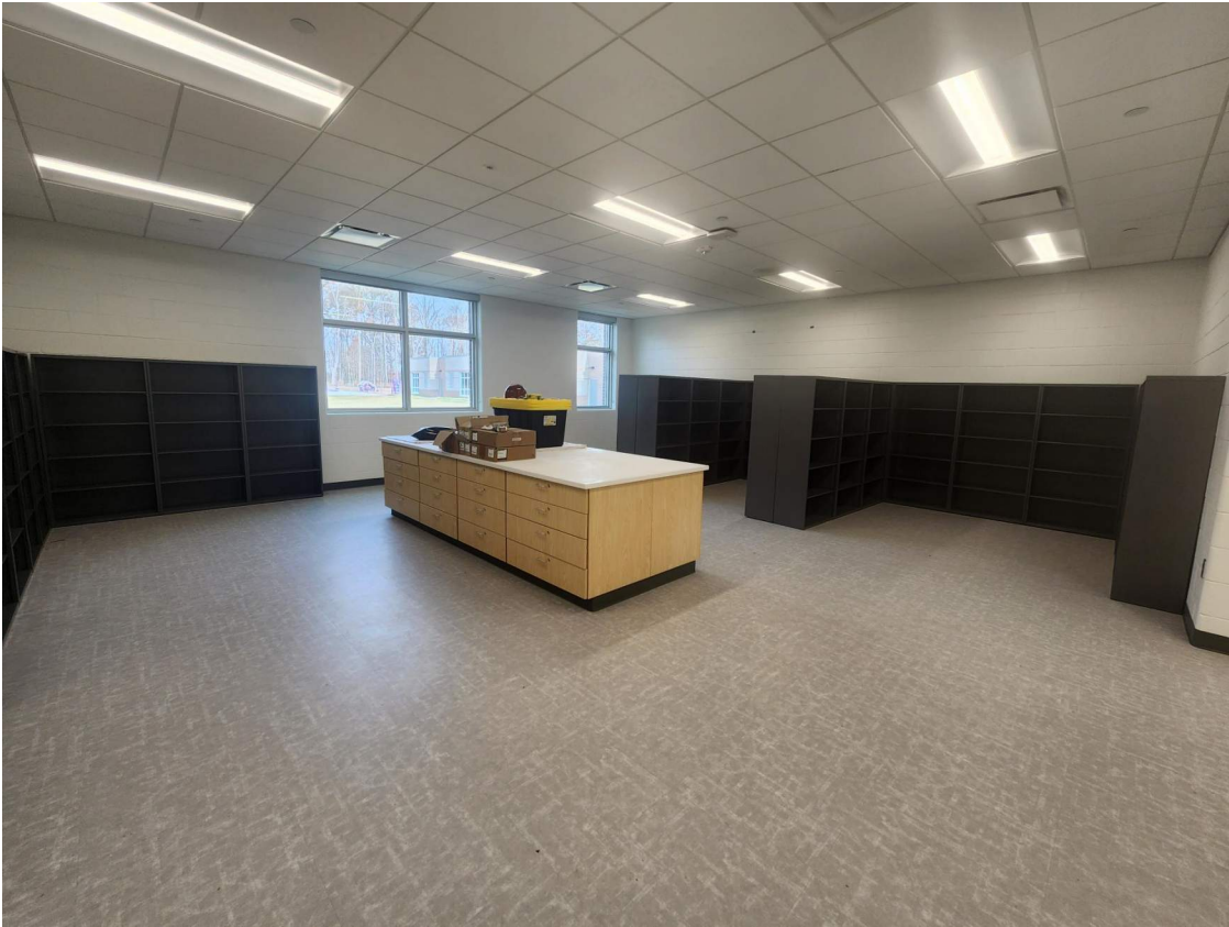
Bookshelves in book storage room.