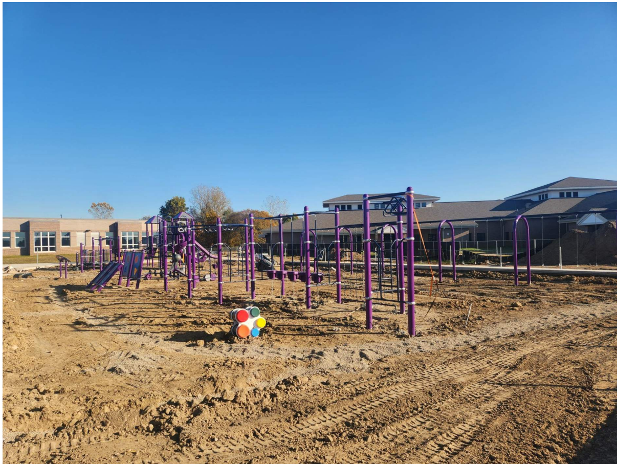
2nd grade playground equipment installed.