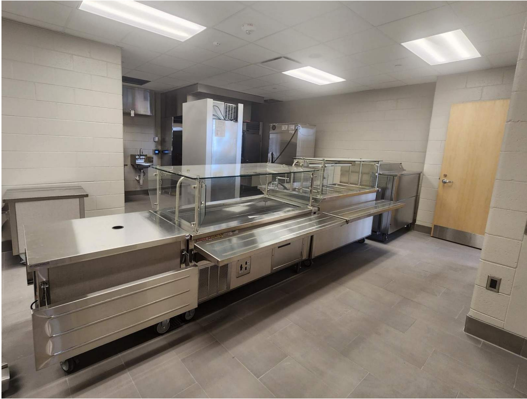
Kitchen equipment set up.