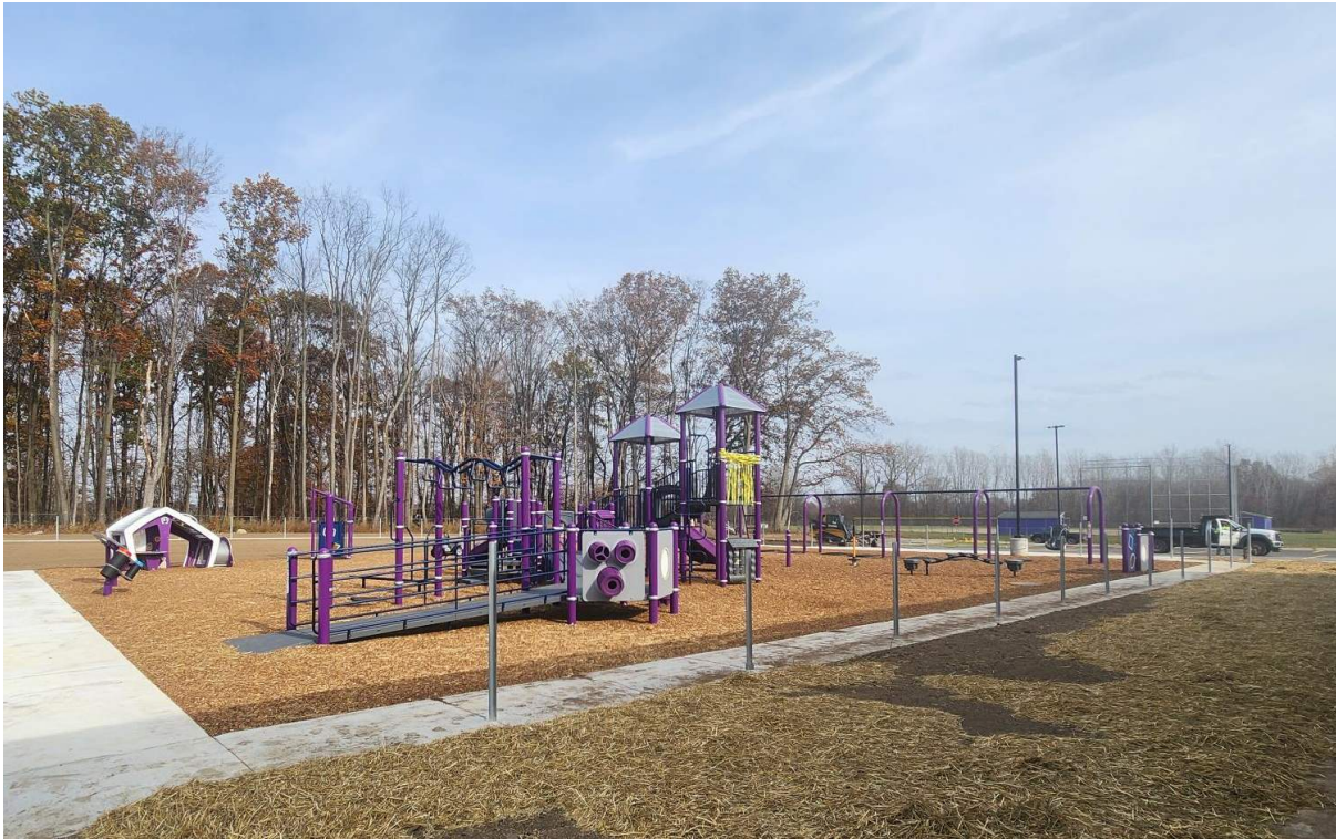
K-1st grade playground equipment install in progress.