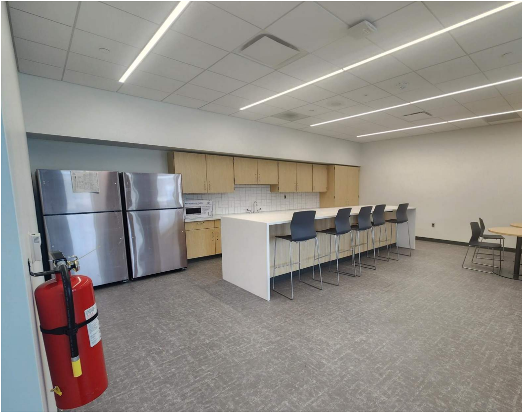
View of kitchenette in staff lounge.