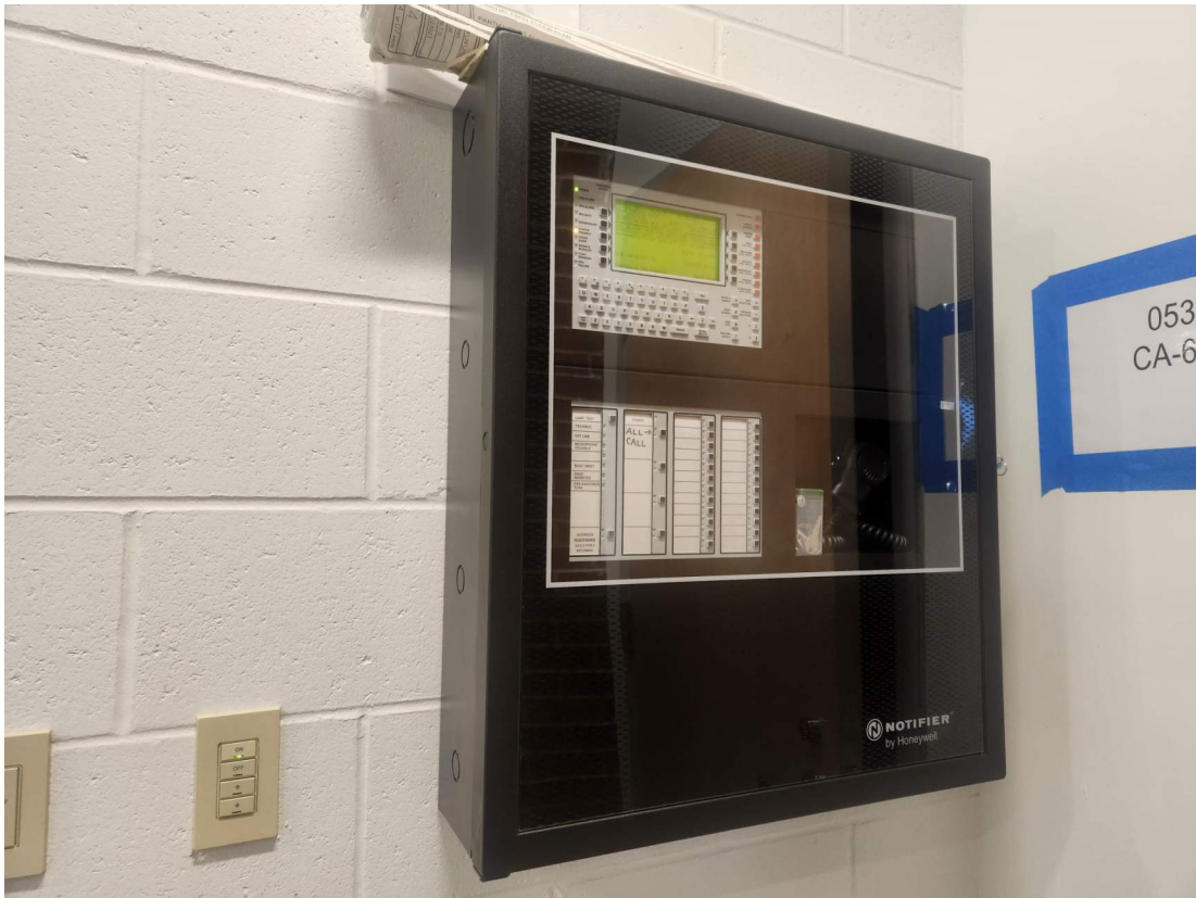
Fire alarm annunciator panel installed in reception.