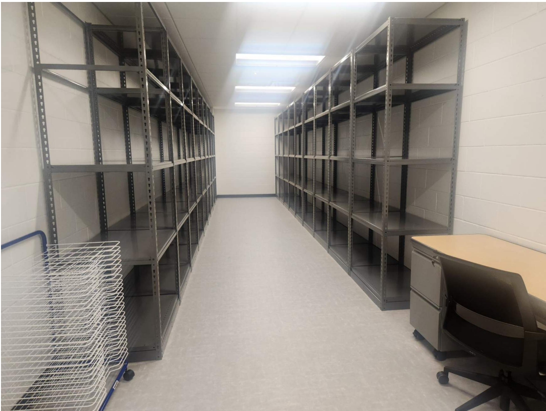
Art storage room.