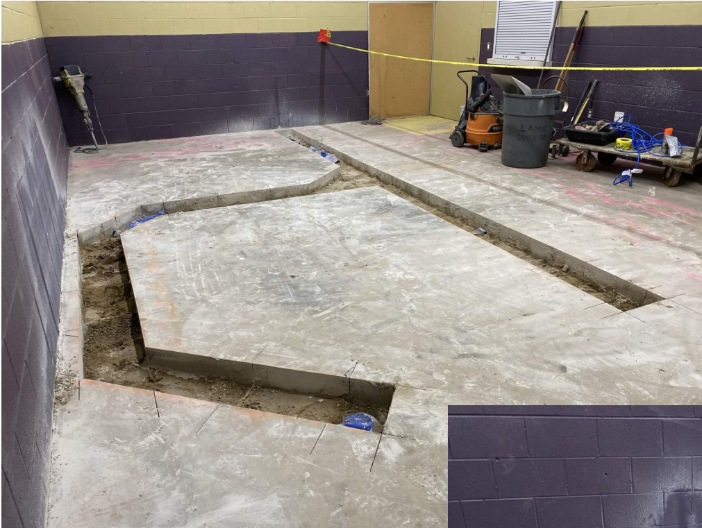
Tool crib floor saw cutting at the high school.