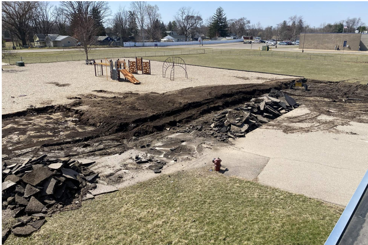
Existing asphalt demo to the west of the building.