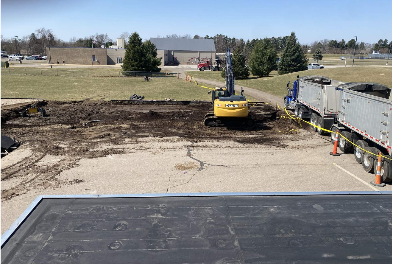
Another view of existing asphalt demo to the west of the building.