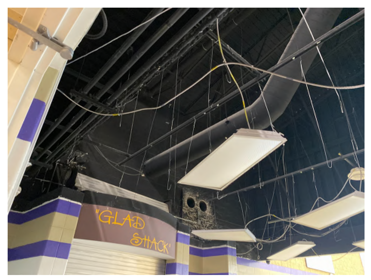
Ceiling grid hangers in the cafeteria.