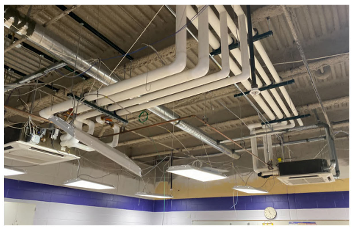
Pipe insulation at ceiling.