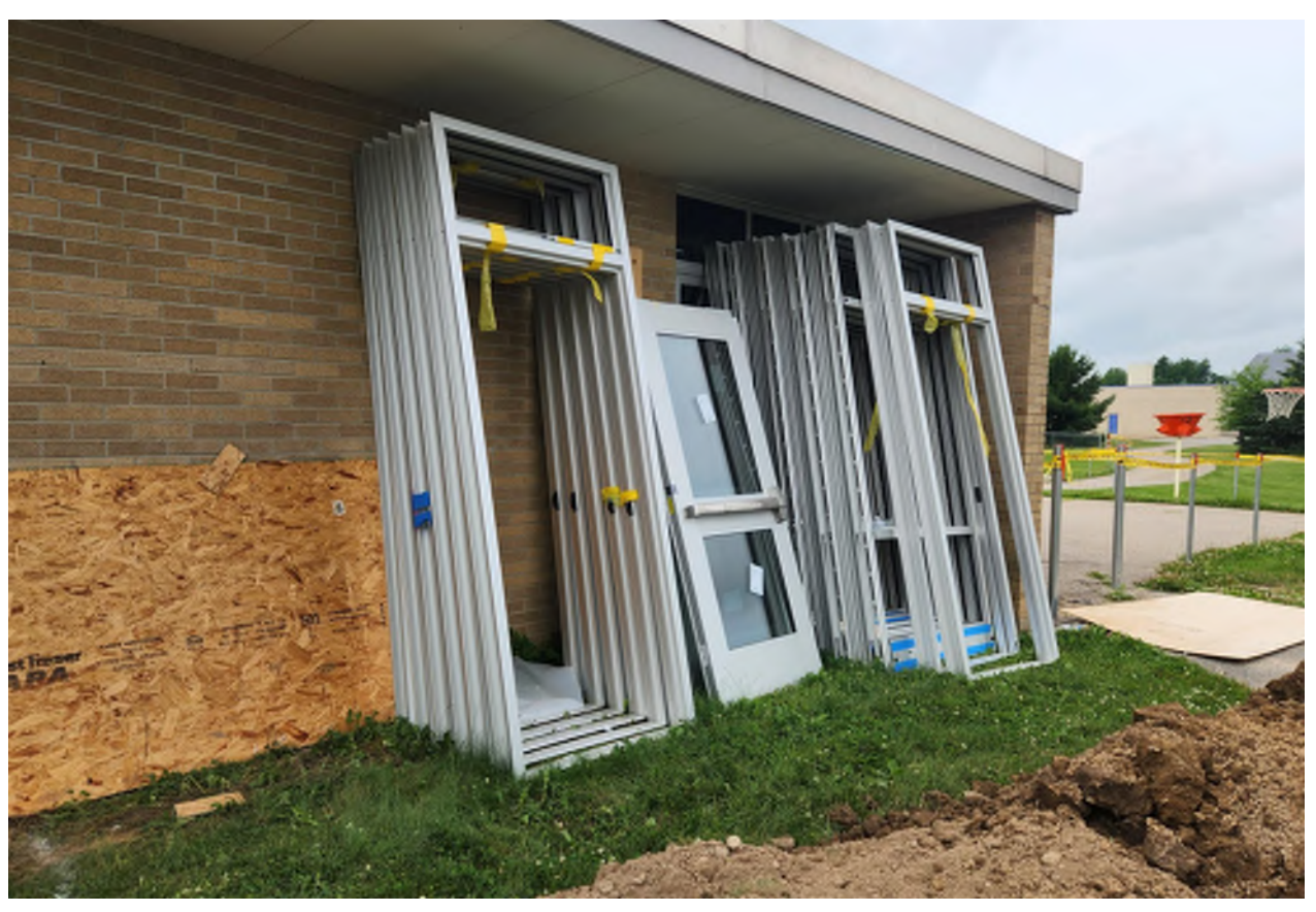
Storefront material staged for install.