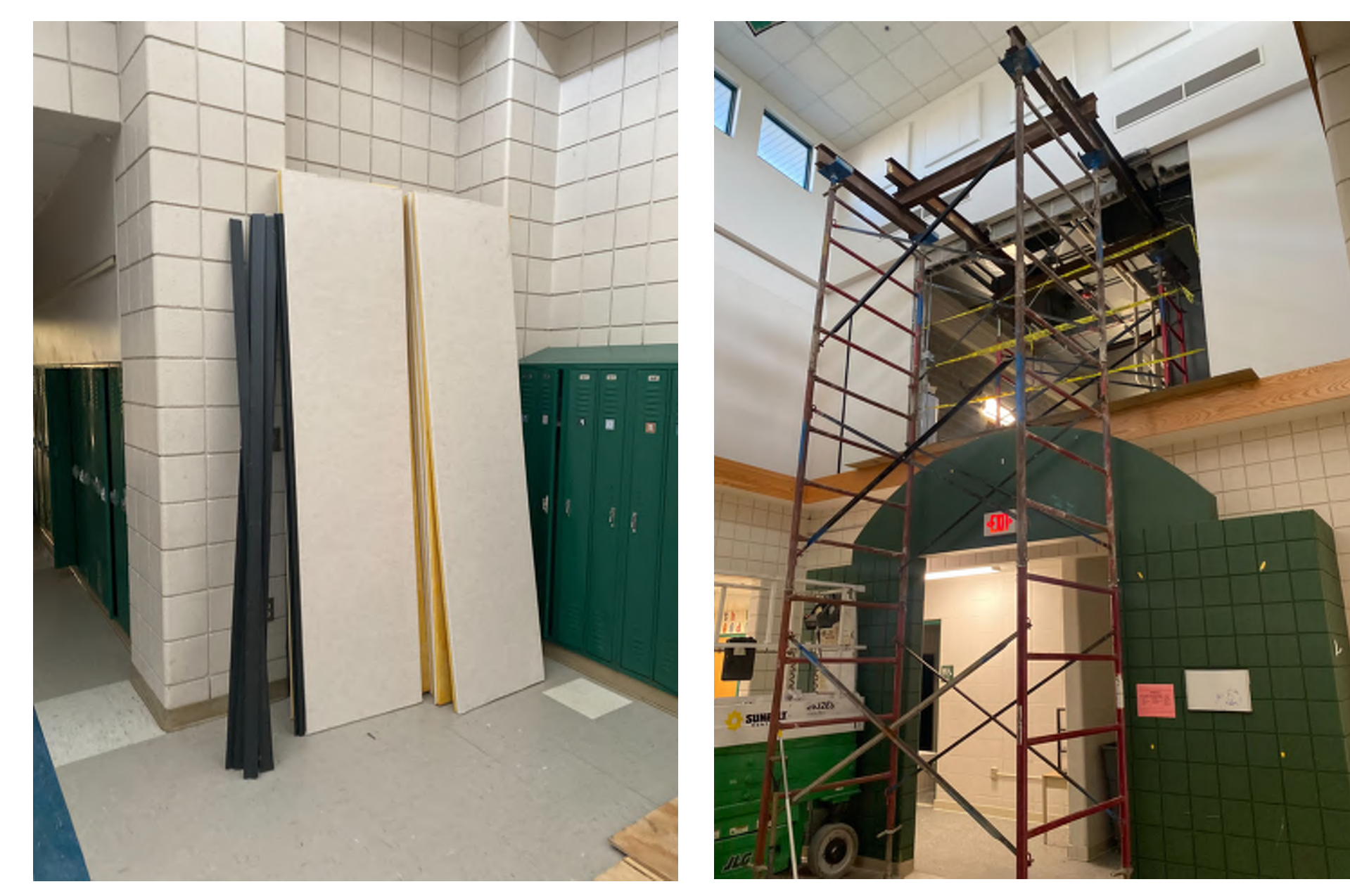
Scaffolding at mezzanine for demo of the wall opening.