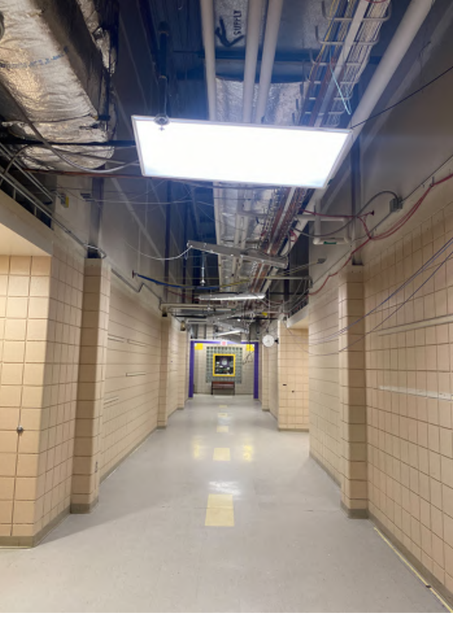
Ceilings demoed in hallway.