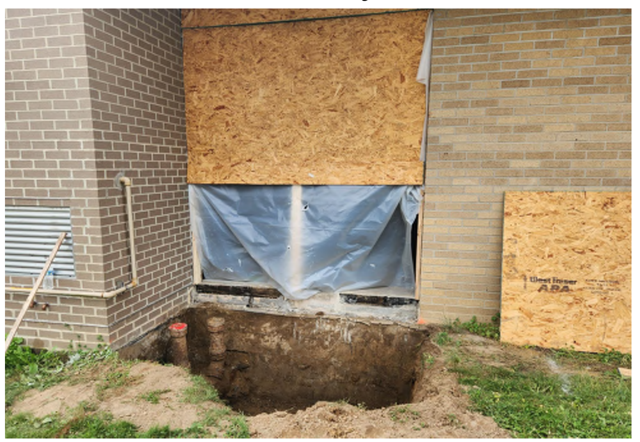
Stoop excavation at a classroom.