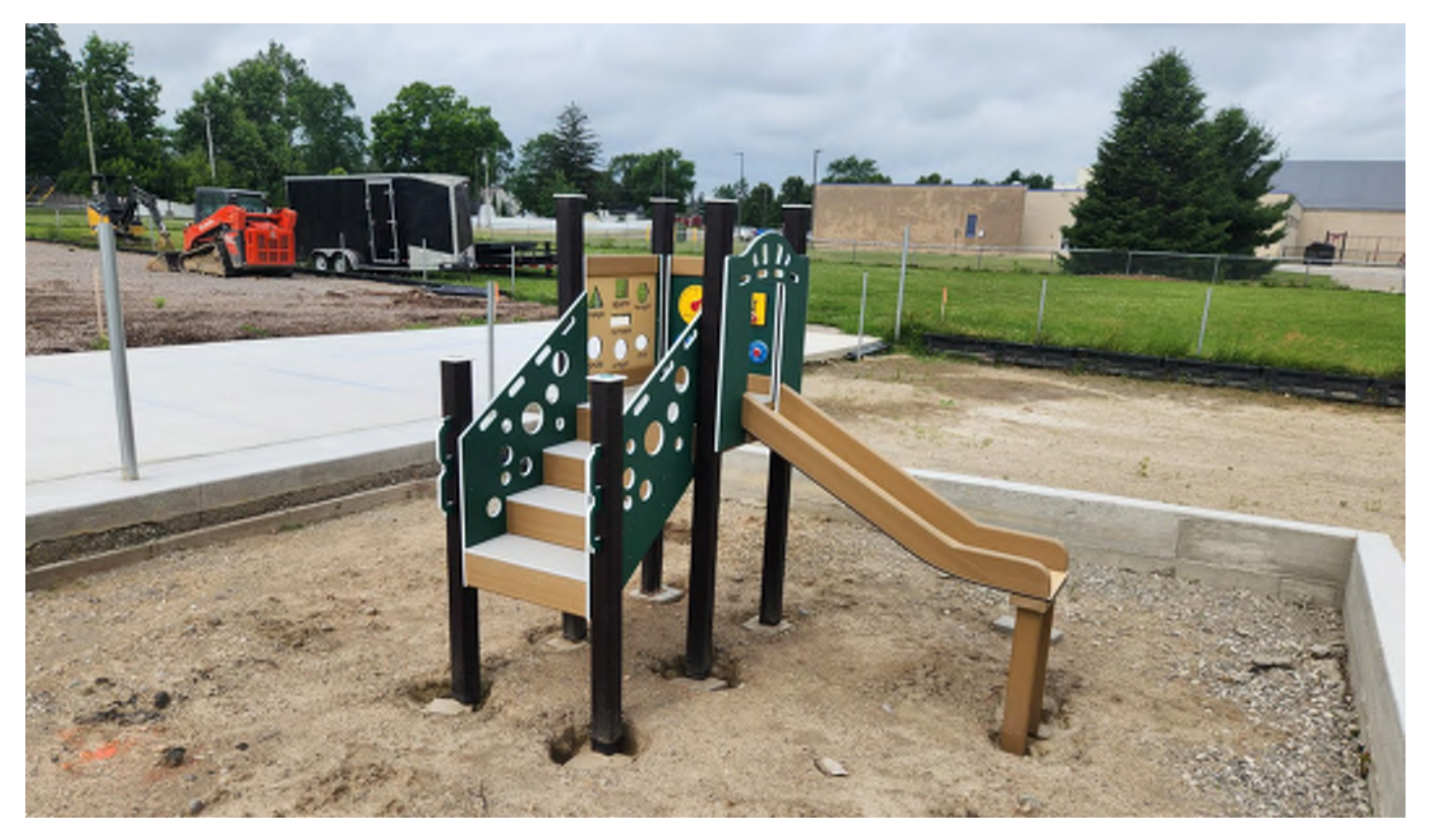
Toddler playground equipment prior to safety surfacing.