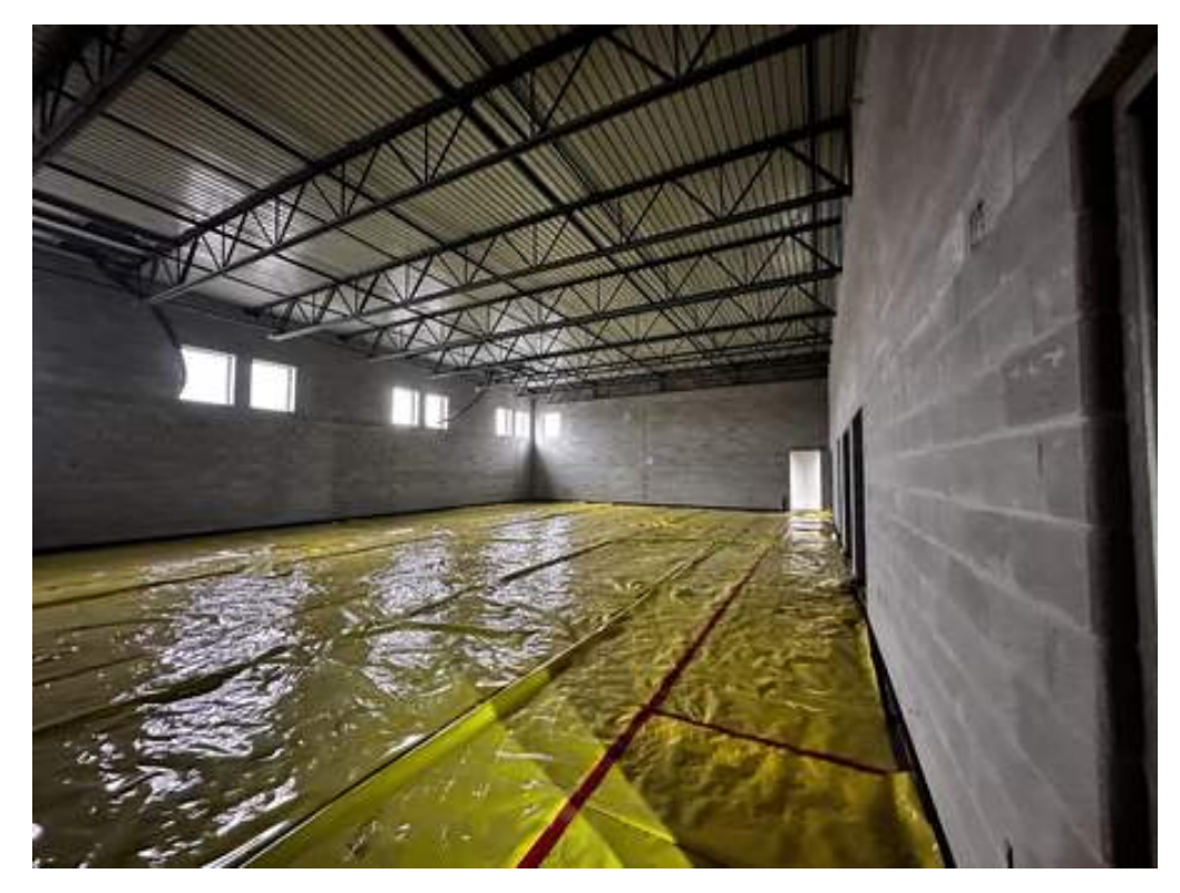
Vapor barrier prep in gym prior to concrete pour.