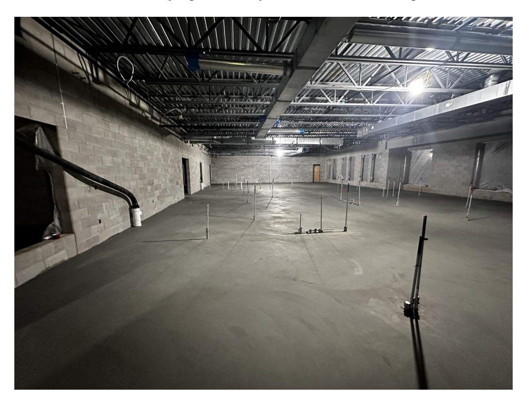
Concrete drying in classrooms on east side of building.