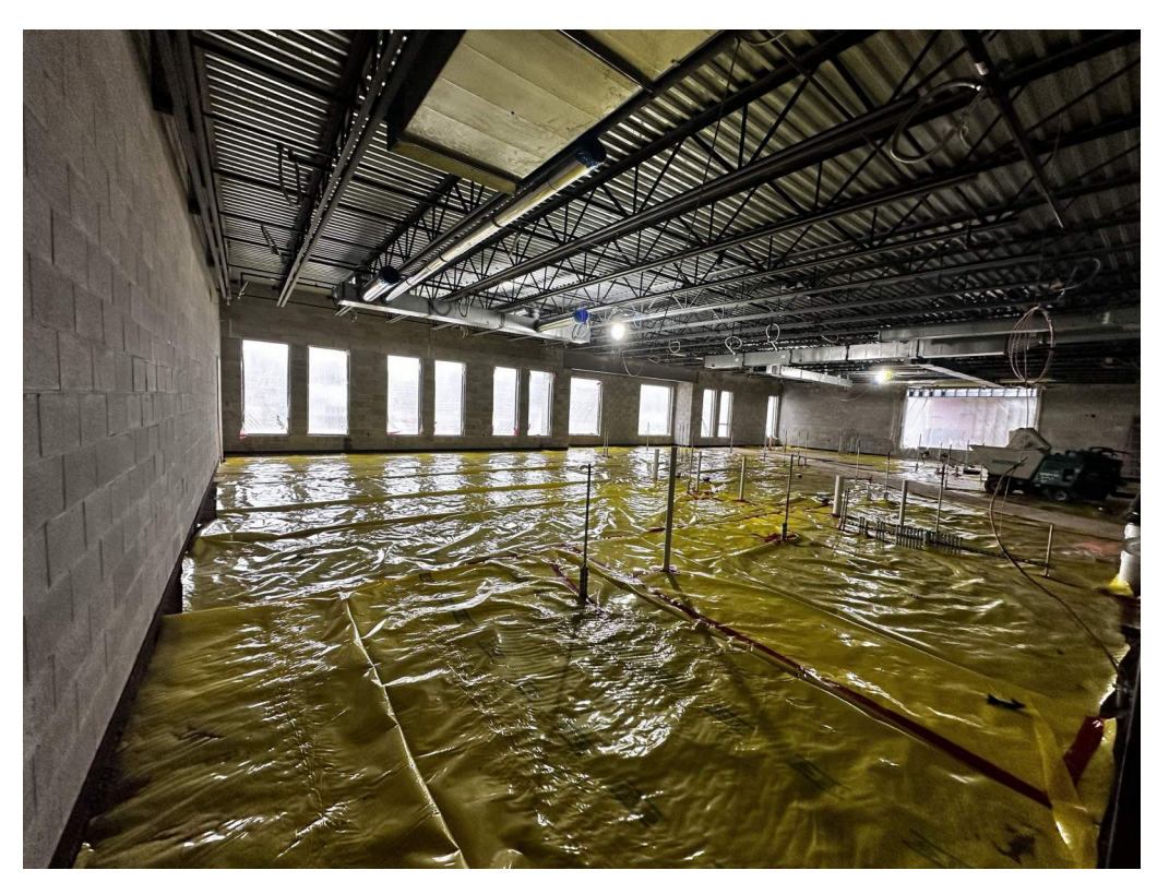
Vapor barrier prep in the main office prior to concrete pour.