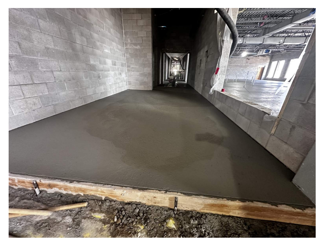
Concrete drying in hallway on east side of building.