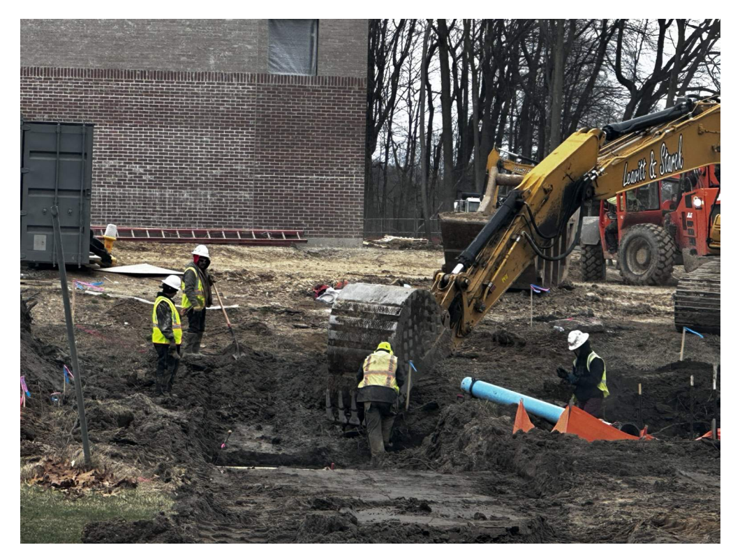
Water main install in progress.