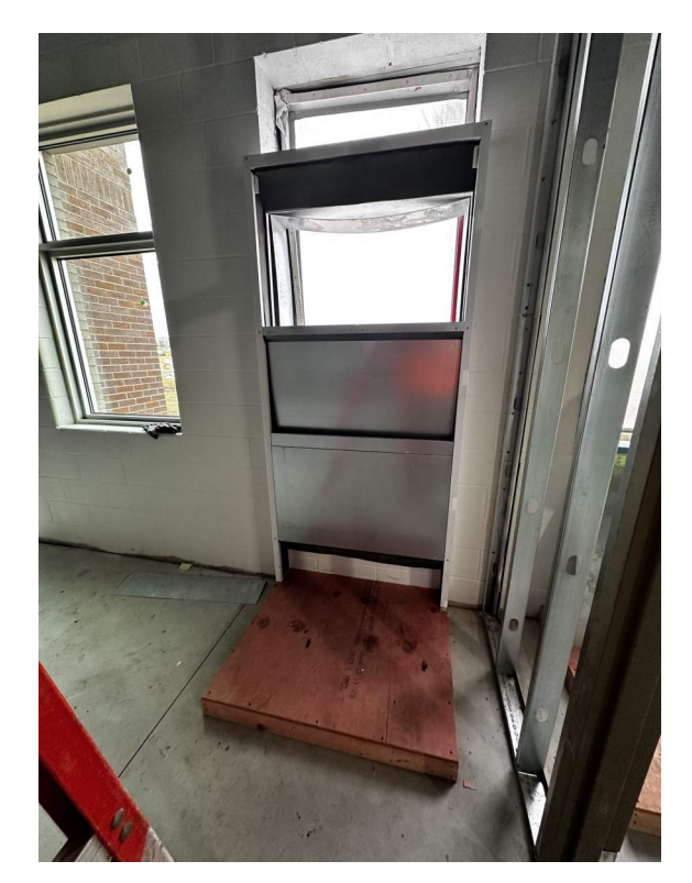
VUV Rear extension and base installed.