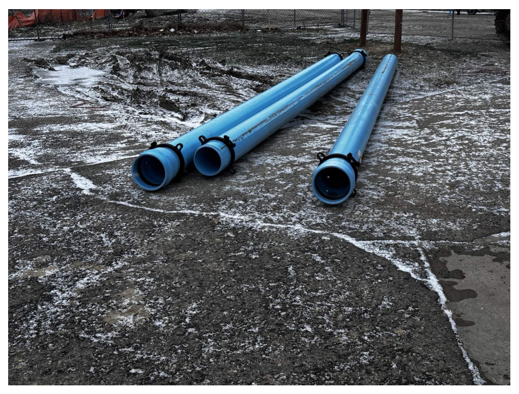
PVC water main material.