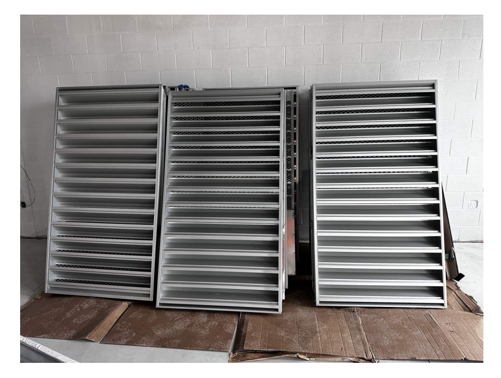
Louvers staged for install.